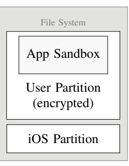
Fig. 2: Schematic depiction of the iOS file system.

File System Checks. iOS maintains two disk partitions: one system partition for the operating system and its components, and a second partition for user-installed apps and data (see Figure 2). While the former is mounted read-only and comparatively